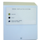
VCS Control Panel